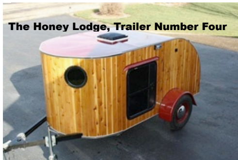
The Honey Lodge, Trailer Number Four

My next trailer, which I completed a few months ago, has a wood exterior and interior, as well as a round front. I have a lot of rare and beautiful woods throughout the trailer, and fixed porthole