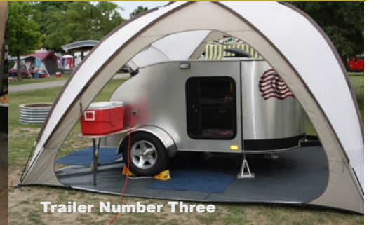
Trailer Number Three