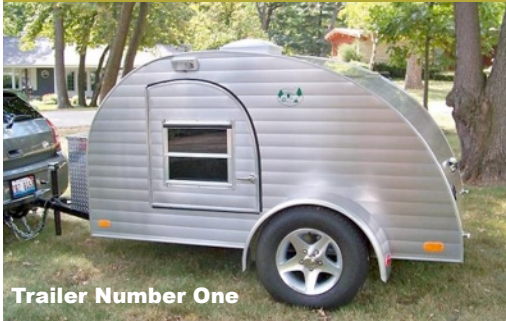
Trailer Number One