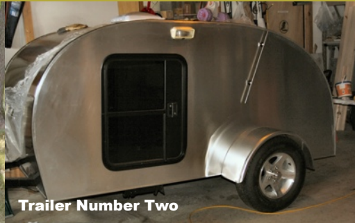
Trailer Number Two